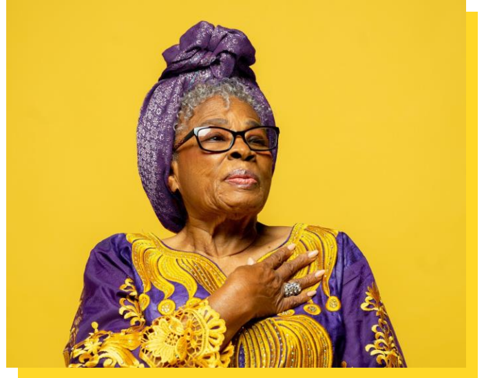
Ms. Opal Lee, 2022