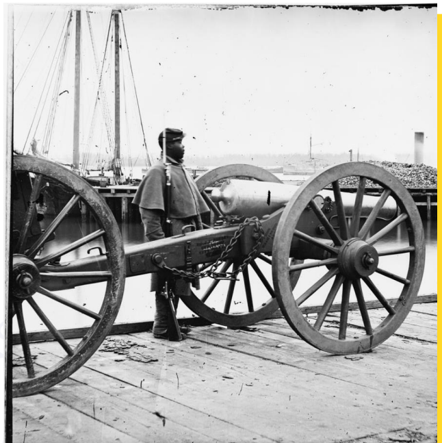
African American Union Soldier, 12-pdr Napoleon c. 1860