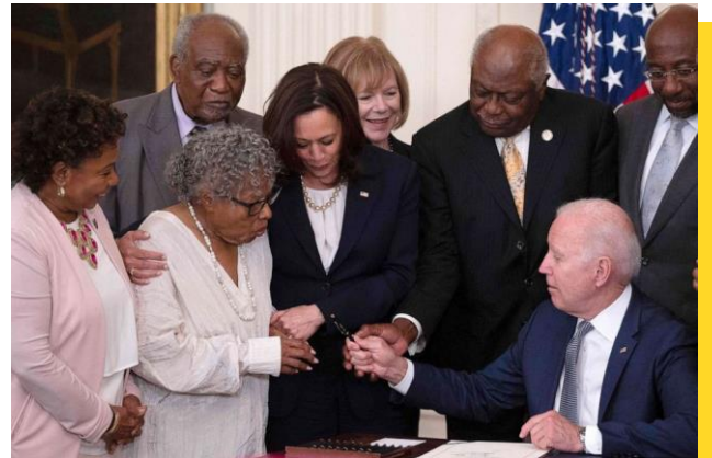
Opal Lee, Vice President Harris and President Biden on June 17, 2021.