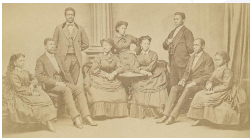
Fisk University Jubilee Singers, c. 1872