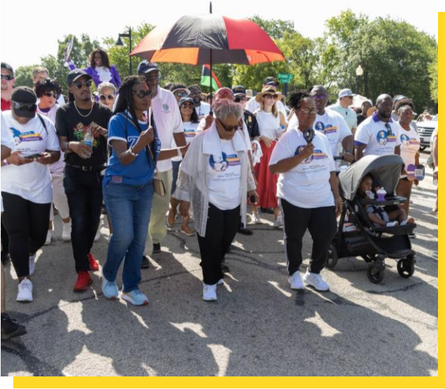
Opal Lee and others on the Walk of Freedom, 2021

She and others campaigned for years to make Juneteenth a national holiday. She would lead a walk 2 ½ miles each year, representing the 2 ½ years it took for news of the Emancipation Proclamation to reach Texas.