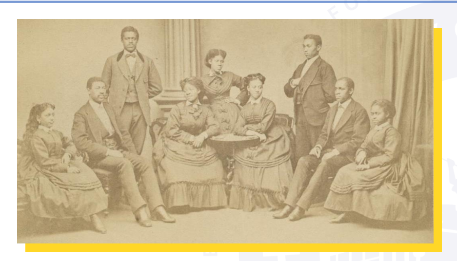
Fisk University Jubilee Singers, c. 1872 Smithsonian National Museum of African American History and Culture