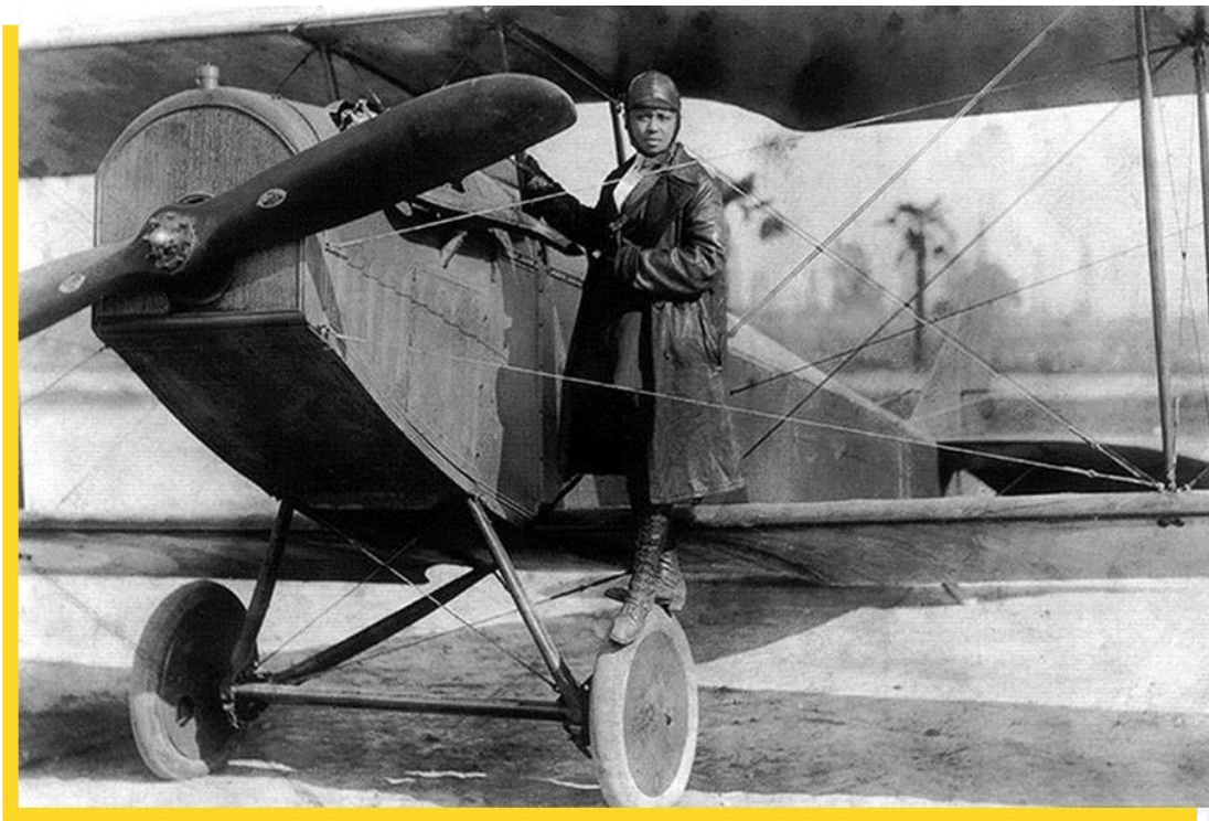
Bessie Coleman with a Curtiss JN-4D, “Jenny” c.1924

She worked for four years as a manicurist, while living with her older brothers. They had come back from World War I, with stories of women who were flying planes in Europe. That sparked her imagination, giving her dreams of learning to fly planes. No women, and no Black Americans, flew planes at that time in the United States.