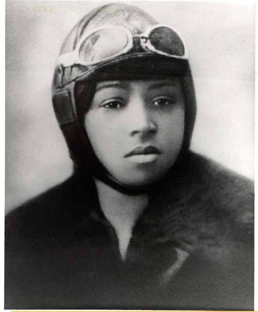
Bessie Coleman c. 1921

With the backing of Robert Abbott, the influential owner of The Chicago Defender , the most popular Black newspaper in the area, she applied to flight school in Paris and was accepted. She taught herself to speak French, boarded a ship to France, and nine months later in 1921, had become the first female and the first African American to attain an International flight license. In Europe, she was considered one of the best flyers they had ever seen.