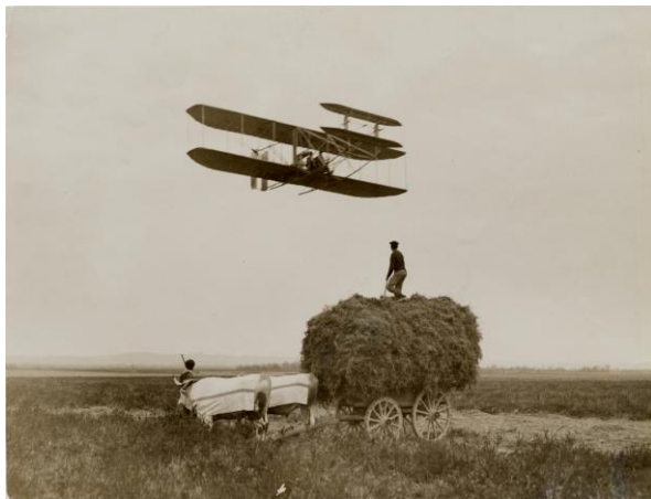
Wilbur Wright piloting the 1908 Wright Flyer in Pau, France.

Their bicycle repair business began to expand, and they eventually had five locations. They found out that airplanes and bicycles had a lot in common and towards the end of the 1890's, they began to build experimental airplanes. These first experimental unmanned airplanes, called Gliders, were nothing more than giant kites. They invented techniques in aeronautical engineering and flight testing that is still used today.