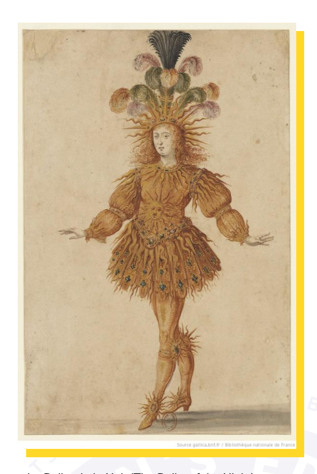
La Ballet de la Nuit (The Ballet of the Night) King Louis XIV, as the Sun God, Apollo. C.1653

Look for these when you watch a story ballet.