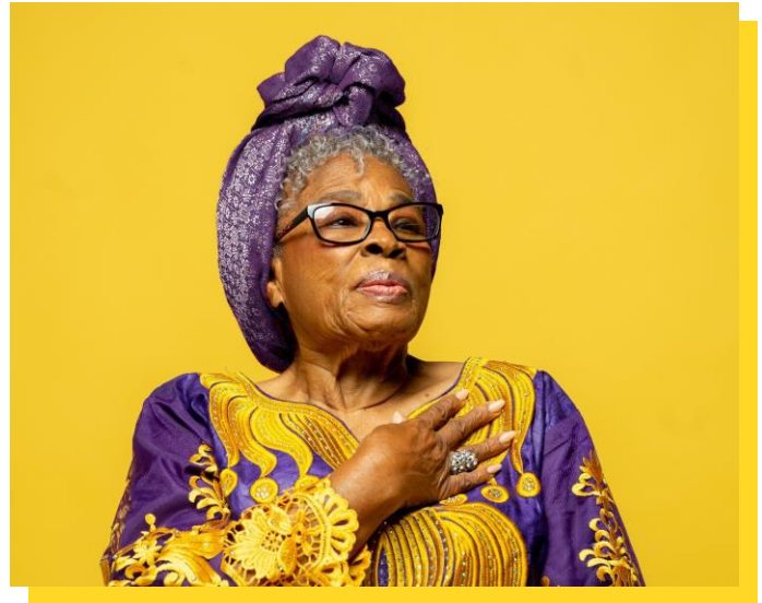
Ms. Opal Lee, 2022