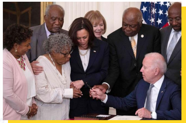
Opal Lee, Vice President Harris and President Biden on June 17, 2021.