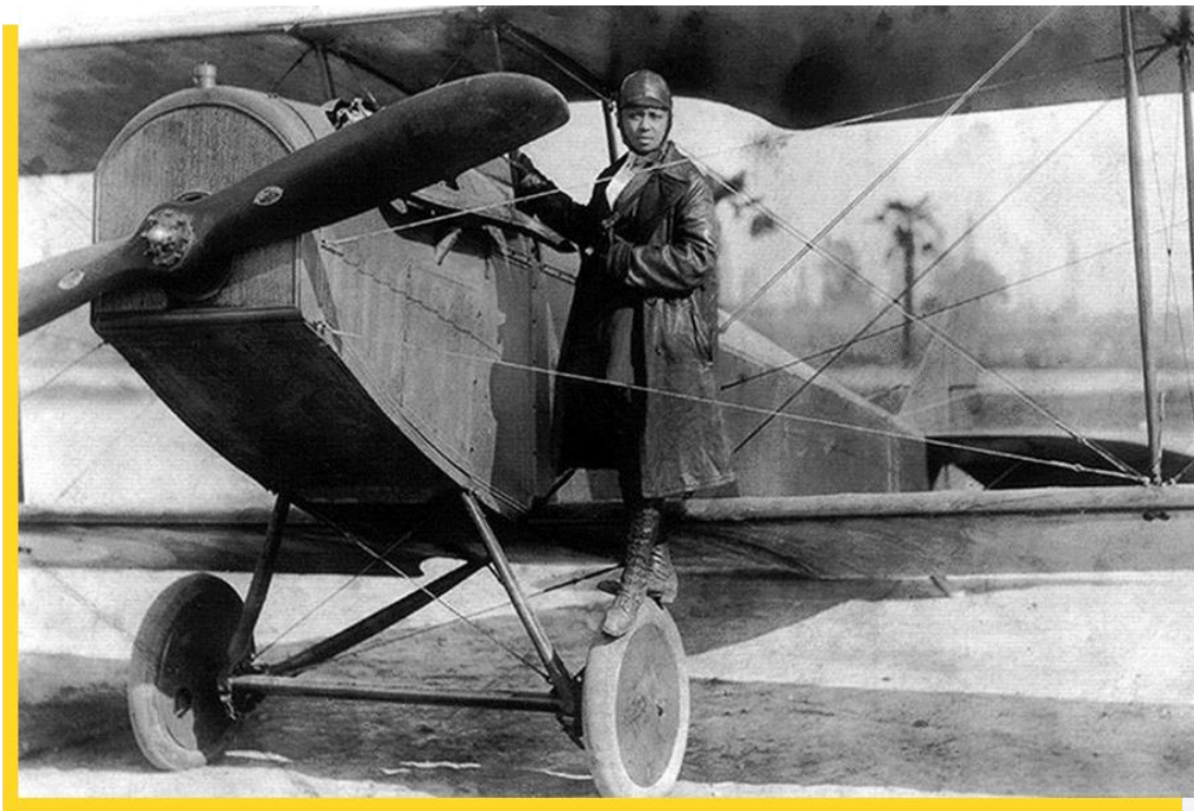
Bessie Coleman with a Curtiss JN-4D, “Jenny” c.1924

She worked for four years as a manicurist, while living with her older brothers. They had come back from World War I, with stories of women who were flying planes in Europe. That sparked her imagination, giving her dreams of learning to fly planes. No women, and no Black Americans, flew planes at that time in the United States.